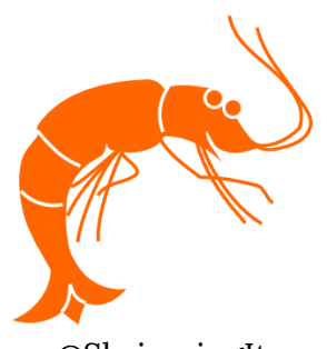
@ShrimpingIt 13 West Street, Morecambe, LA3 1RB