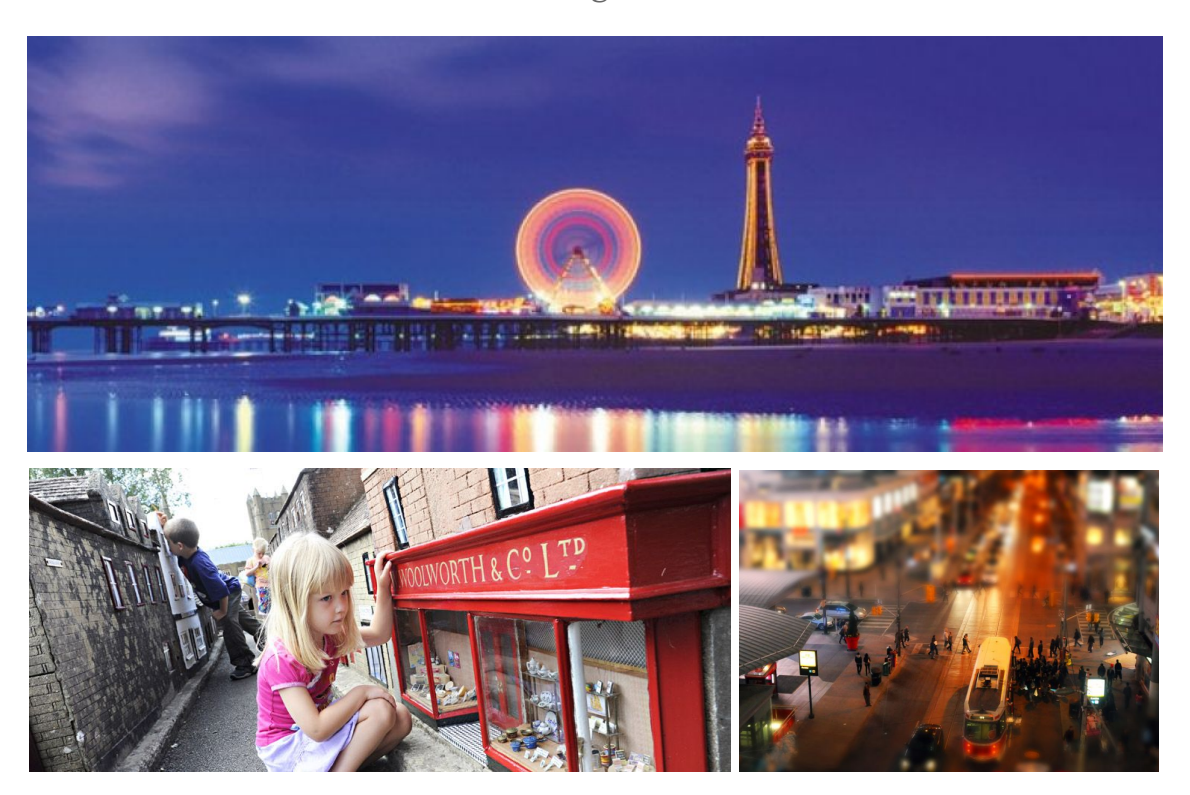
by Cefn Hoile on 5th July 2016

The Illuminations at Morecambe's Happy Mount park once competed with Blackpool to attract visitors alongside an installation of 400,000 bulbs running the whole length of the promenade, and with lights switched on by celebrities such as George Formby, Roger Moore, Morecambe and Wise and even Angela Rippon!